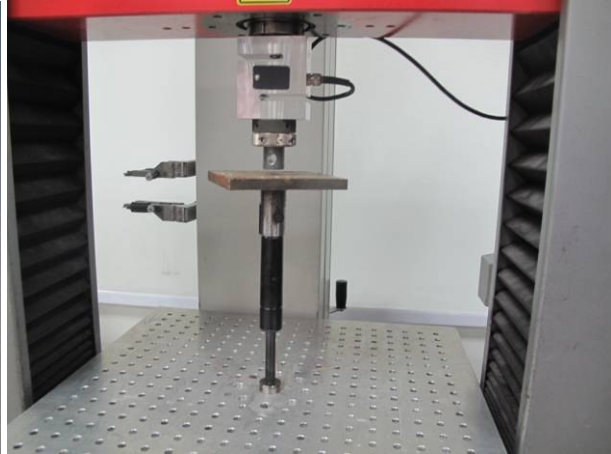
Sample in Mechanics performance test